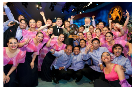
Choir of the World 2010