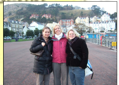
ectarc's German colleagues on a visit to Llandudno, North Wales to get to know our country first hand

Programm für lebenslanges Lernen Leonardo da Vinci