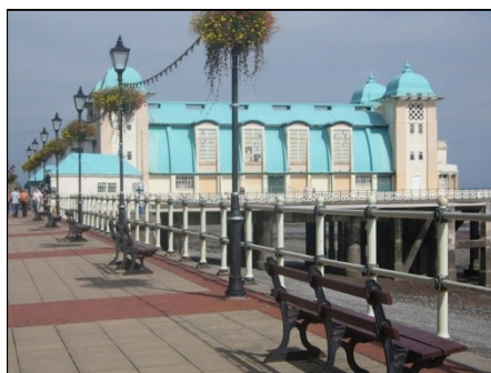
Penarth Pier overlooking the Bristol Channel