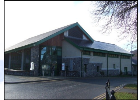
The Glasdir centre in Llanrwst

ectarc would like to say a big THANK YOU to all the people at the Glasdir Centre in Llanrwst for organising ectarc 's first open day on February 16th this year. This day was organised to give aspiring host families and companies a chance to meet the ectarc staff in person to hear first hand about the Leonardo da Vinci programme and how it can be of benefit to them. We received a very positive response so thank you to everyone for their support.