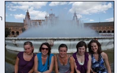
ectarc participants in Seville